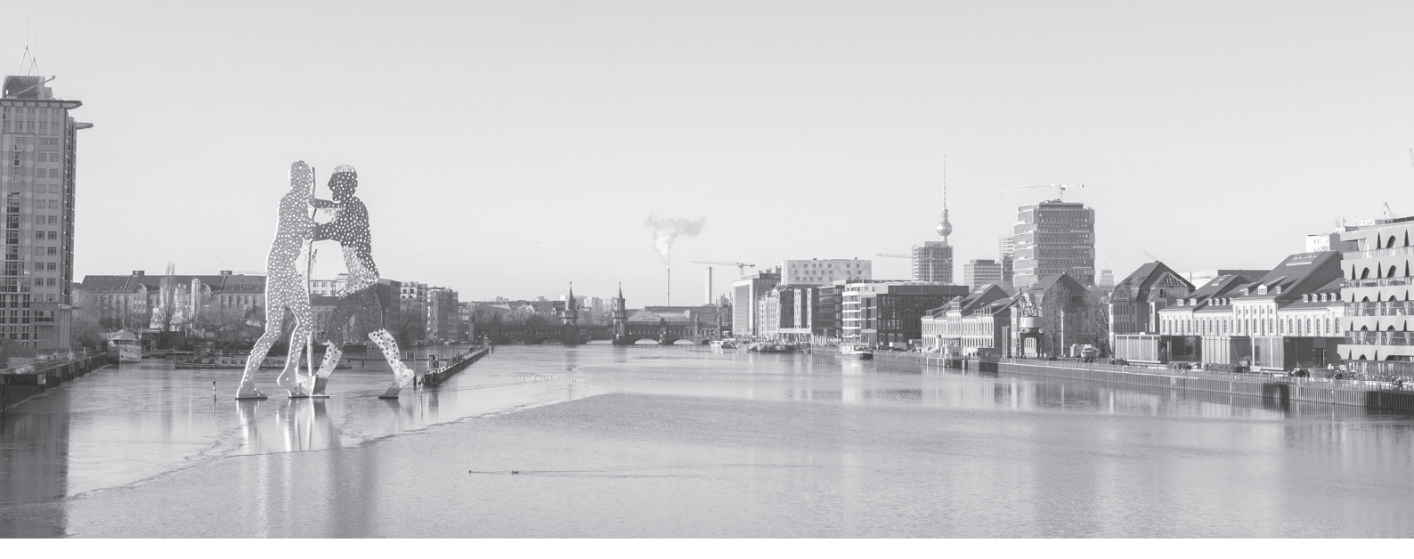
Summarised Annual Report 2021